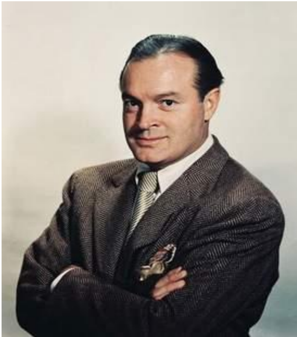
BOB HOPE (2003)