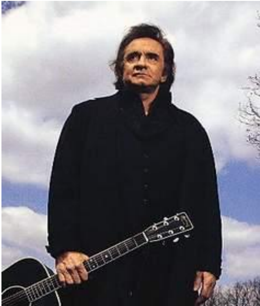
JOHNNY CASH (2003)