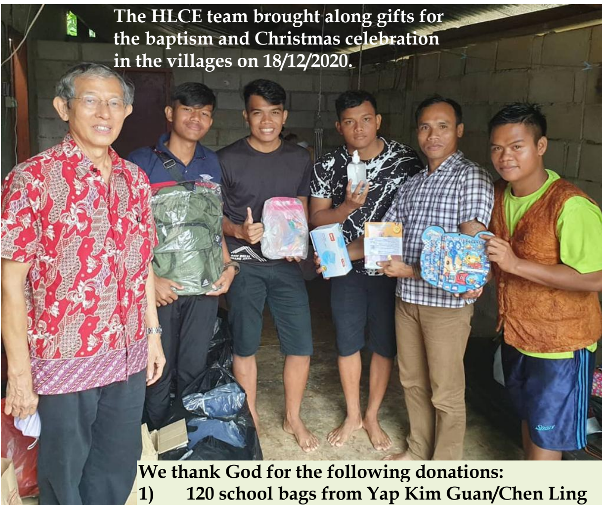
The HLCE team brought along gifts for the baptism and Christmas celebration in the villages on 18/12/2020.

We thank God for the following donations: