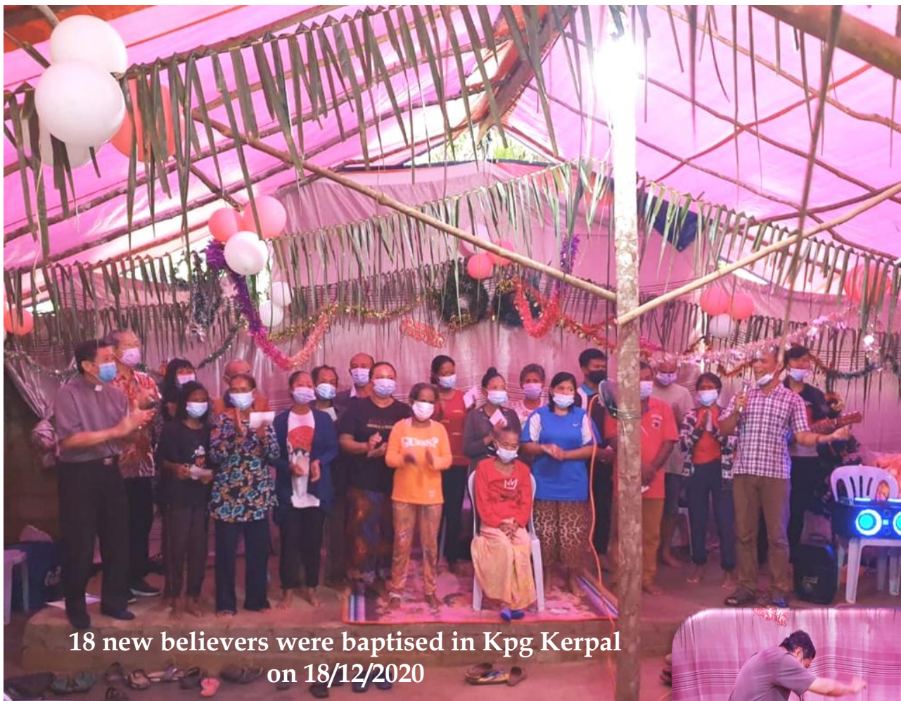
18 new believers were baptised in Kpg Kerpai on 18/12/2020