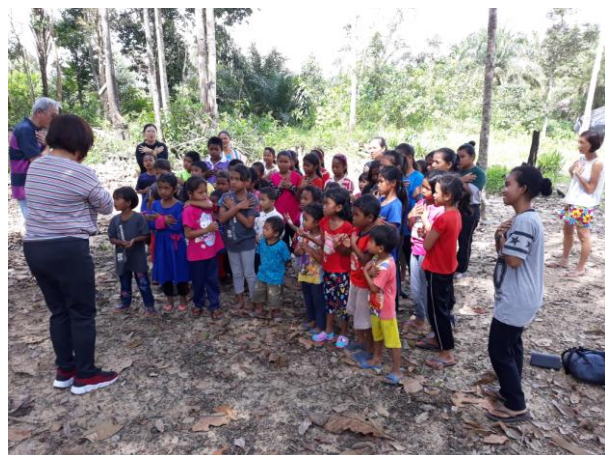
Sunday School in Kpg Jemeri on 29.2.2020