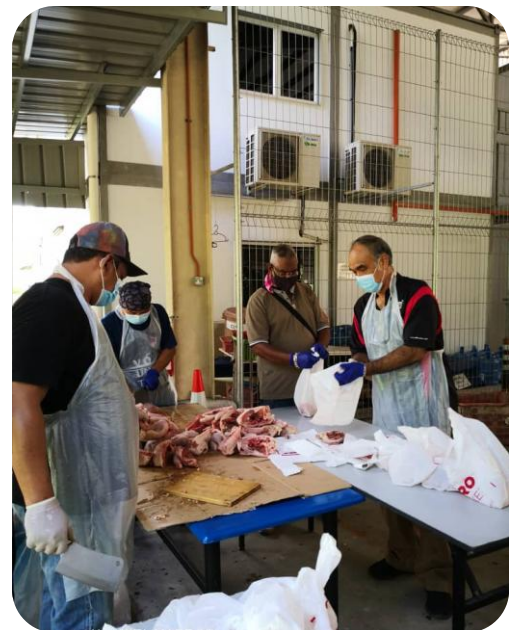
400 families received half a chicken from Aqina Farm, Ulu Choh