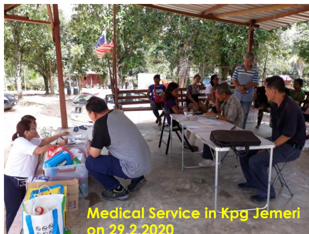
Medical Service in Kpg Jemeri on 29.2.2020

NB: Contributions to Sinews newsletter, via email to spcheong88@gmail.com (in Microsoft Word format), in the form of articles, testimonies and original photographs (with captions) are welcome, but we reserve the right to edit them in the interest of HLCE. Views and opinions expressed herein do not necessarily represent that of HLCE or the editor.