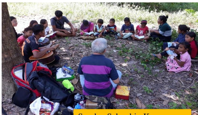
Sunday School in Kpg Rantau Panjang on 29.2.2020